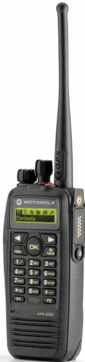
MOTOTRBO XPR 6550