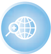
MOTOTRBO Location Services